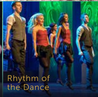
Rhythm of the Dance