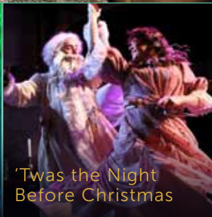
'Twas the Night Before Christmas