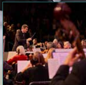
LANSDOWNE SYMPHONY ORCHESTRA