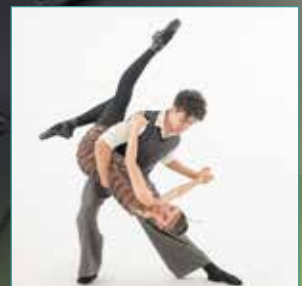
PA BALLET II | Bourbon Street, Celtic Fire and Fairy Rhymes