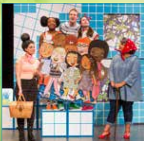
ROSIE REVERE, ENGINEER & FRIENDS | Theatreworks USA!

The talented members of PBII share their craft for dance aficionados and family audiences!